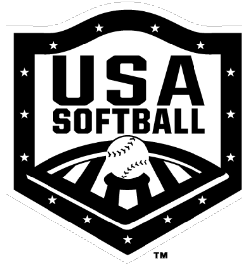
Adult Fast Pitch/All SlowPitch